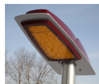
Yellow acrylic glass for roundabouts, pedestrian crossings, etc.