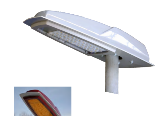
Yellow acrylic glass for roundabouts, pedestrian crossings,