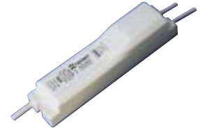
Electronic constant-current transformer (EVG)

The typical characteristic curves are identical!