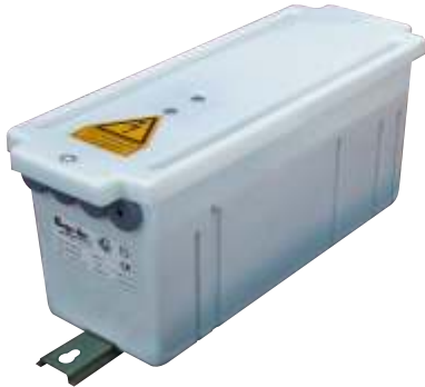
Independent constant-current transformer