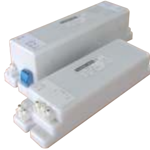
Constant-current transformer for built-in applications